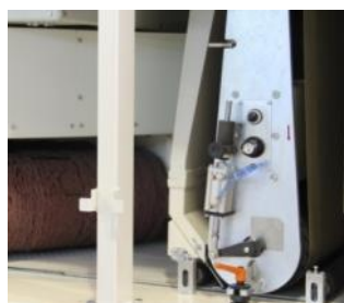
Deburring contact roller head before edge rounding