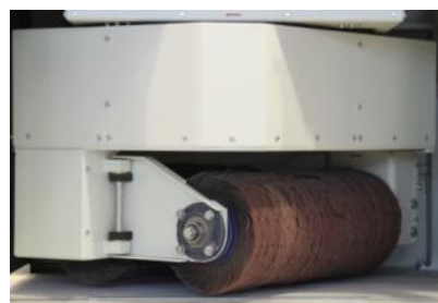
Double brush planetary head station with oscillation