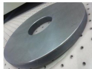
Conveyor belt with vacuum system